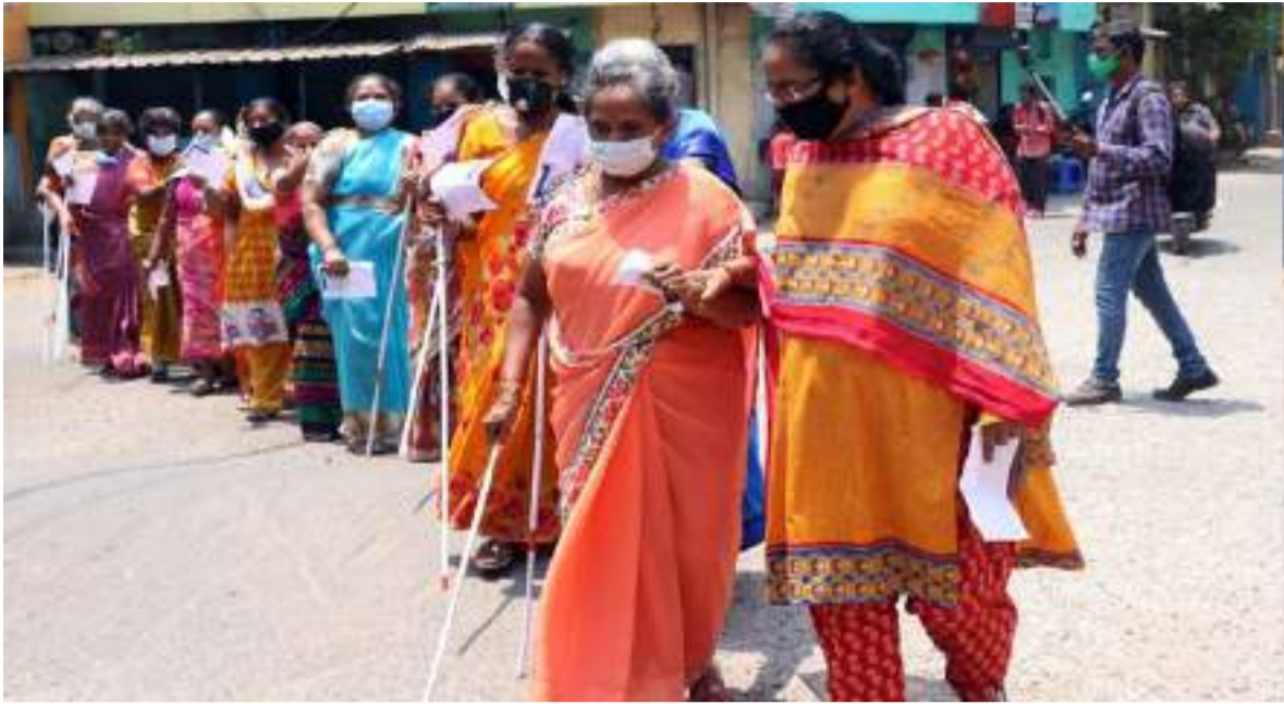
Chennai: GNS News Agency, April 7

Tamil Nadu recorded a voter turnout of 65.11 per cent in the single-phase Assembly elections that took place on Tuesday. Voting in all 234 assembly constituencies in 38 districts of the state had begun at 7 am.