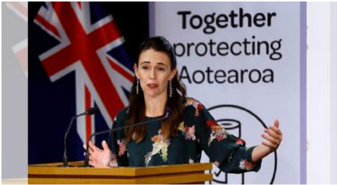
Wellington: GNS News Agency, April 7

New Zealand announced on Tuesday it will open a long-anticipated travel bubble with Australia on April 19.